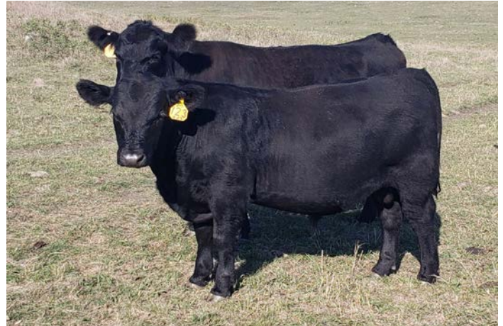
Fast Homesteader 123, Lot 1 with his dam, Fast Blackcap TR 923. She is a first-calf heifer.

Suitable for heifers or cows. A bull that combines calving ease with outstanding growth performance, carcass quality and high maternal traits. He posts a +80 for $M and a +83 for $W which ranks him in the top 10% for both traits. If you strive for quality and uniformity, pair him with his 3/4 brother, Lot 4. Dam's ratio: 1/104.