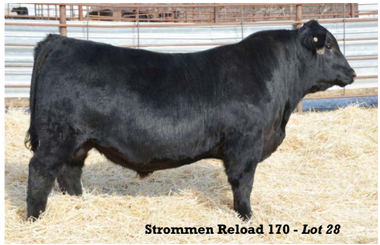
Strommen Reload 170 - Lot 28

The Targeting the Brand™ logo can be used on any registered Angus bull with a minimum marbling EPD (Marb) of +.65 and Grid Value Index ($G) of +55 or higher. Data from the American Angus Association show that these minimums thresholds for Marb and $G achieve an average of 50% Certified Angus Beef (CAB) acceptance. The logo helps bull customers to easily find bulls with added carcass value.