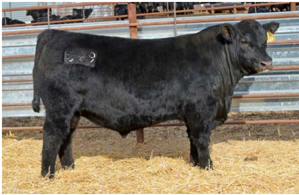
Fast Uncontest 029 in our 2021 sale sold to Tracey Hoherz, Mandan, ND. He is a flush full brother to Lot 18.

Suitable for heifers or cows. This bull here is one that will continue the 24 female line of consistency. Really nice looking bull calf here with a great EPD profile and one of the better pedigrees. He has very top end feet and claw and angle EPD are top 2%!