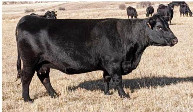
Fast Primrose Conf 370 , the Pathfinder dam of Lot 45 and donor dam of Kerry Slaughter's bull as well as two other flush brothers that sold in 2021.