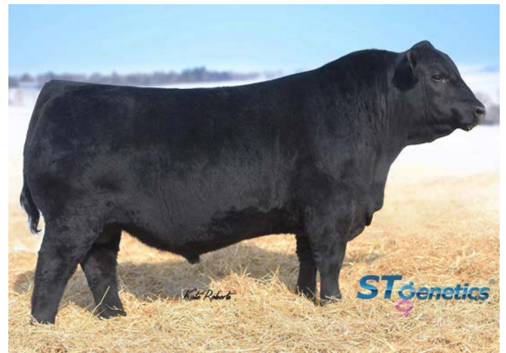
SAV Renew 8132

Renew was the top selling Renown son in the 2019 SAV sale and a crowd favorite for his massive build and gentle disposition. His calves are powerhouses with outstanding performance and eye-appeal. Renew is deceased and there is limited semen available. Take advantage of this sale where some of his best sons are offered!