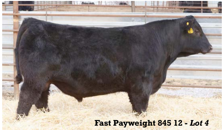
Fast Payweight 845 12 - Lot 4

Suitable for heifers or cows. A bull stacked with muscle, depth and good looks that combines the calving ease genetics of Treasure and superb maternal traits and performance of Basin Payweight 1682. He ranks in the top 10% of breed for CED and top 1% for CEM of +16. Dam's ratio: 1/103.