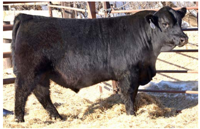
Strommen Platinum 683 is the maternal sire of Lots 14, 16, 35 and 39. His daughters have exceptional length of body, quality udders and docile dispositions.

Visit us at the ranch and attend our sale to learn why our customers are happy with their bulls!