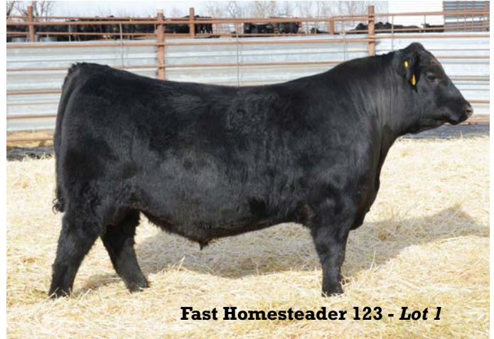
Fast Homesteader 123 - Lot 1

Starting out the sale offering is this big volume, super attractive, well-balanced and long-bodied bull that combines weaning performance and carcass quality. You'll like him by his numbers too! He ranks in the top 15% or better for 17 EPDs and posts a SC: +1.02, Marb: +1.06, and Doc: +33. He is a very gentle, easy to handle bull that likes to be scratched. His dam is an outstanding, deep bodied Treasure daughter that has calved in the first cycle with her second calf. Dam's ratio: 1/117. Retaining a 1/4 interest.