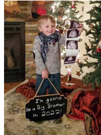
Rowdy is looking forward to becoming a big brother in May!

The last natural calf from the great Fast Primrose Conf 370 cow and among the youngest bulls in our sale offering. In spite of his youth, he has good growth performance which his dam is known for producing time after time. Dam's ratio: 7/104.