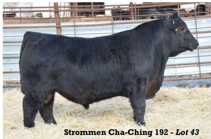
Strommen Cha-Ching 192 - Lot 43

Highest weaning bull this year! What a stout dude! 192 has thickness, is correct, and out of a great cow family! 40% of the Strommen bull offering went back to the Erica FL 734 cow. This Bull is a Stud! He is a bull with great growth and you won't find him waddling around from being too fat! He's the right type and kind to produce great females and growthy males! Dam's ratio: 1/122. Retaining 1/4 interest.