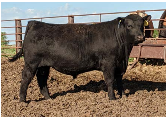
Fast Cha-Ching 97 on the Joseph Angus Ranch, Winner, SD. Cha-Ching sold in our 2020 sale and has been used quite heavily in our herd.

A very good Raindance bull out of our great 3128. He is a big middled, big capacity bull that should put big pounds on the ground. His dam is a 6 frame cow with loads of capacity and superior maternal abilities. Use him on any type of cattle and produce nice replacement females. Dam's ratio: 3/104.