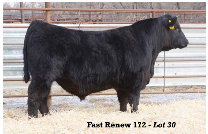
Fast Renew 172 - Lot 30

Suitable for heifers or cows. This super attractive, structural correct and long-bodied bull combines the great maternal trait sires Connealy Answer 69 and MCC Daybreak. He ranks in the top 10% for CED and BW as well as top 1% for CEM. He is super docile and likes to be scratched. Dam's ratio: 2/95.