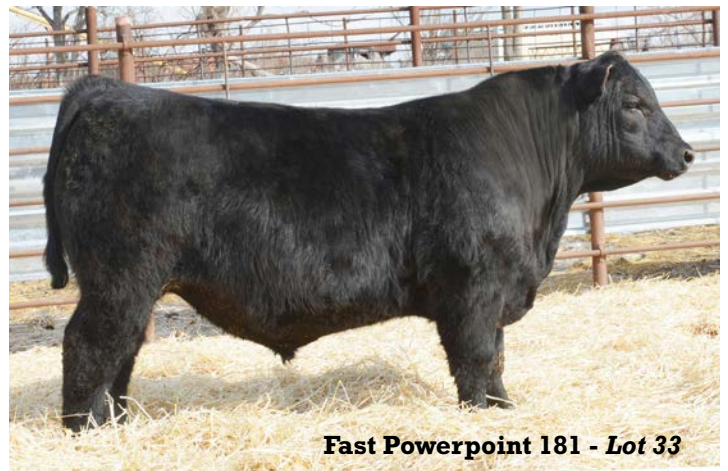
Fast Powerpoint 181 - Lot 33

A powerhouse bull that is wide from top to bottom with loads of muscle expression! He is alert and upheaded, but you can walk up and scratch his head. Outstanding growth performance, he posts a WW ratio of 115 and ranks in the top 5% for WW, 3% for YW, and 5% for $B and $C. His dam is a deep-bodied, heavy milking Resolute daughter. Dam's ratio: 4/110.