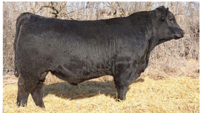
Fast Capitalist 414 was one of the best female producers ever used at Fast Angus. His daughters have some of the best udders Jeremy has seen anywhere and in any herd. They consistently produce heavy calves with a moderate frame size and have a superior fleshing ability. The best thing about them is their superior mothering instincts and yet are real docile to handle.

A bull with exceptional length of spine, massive width over his top and rump. Stout made and good substance of bone, he comes from an outstanding maternal background with Connealy Confidence and Sitz Rainmaker 6169 as his maternal grand sire and great grand sire. His Pathfinder dam has superb udder quality. Dam's ratio: 7/105.