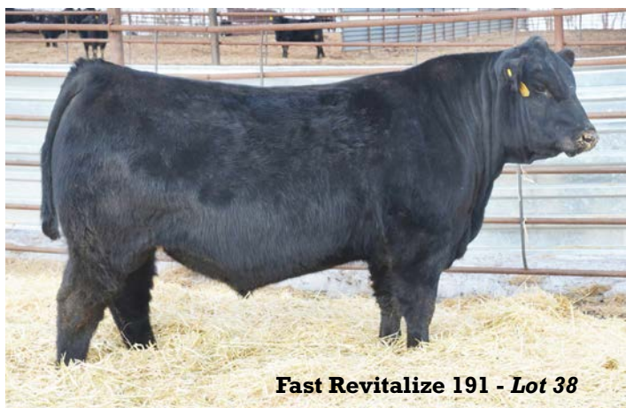
Fast Revitalize 191 - Lot 38

A STUD right here! He has an amazing massive phenotype and an excellent EPD profile to match! He has three very important EPDs in the top 1%: Angle, Claw and $M. Top 10% or higher for WW, YW, $W and $C. His Pathfinder dam has excellent udder quality and consistently calves in the first cycle year after year. Dam's ratio: 5/108. Retaining a 1/4 interest.