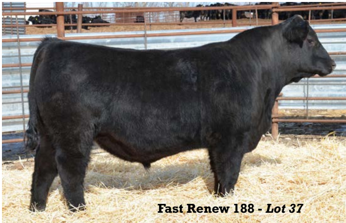
Fast Renew 188 - Lot 37

Suitable for heifers or cows. A calving ease bull, plus high growth performance, plus ideal carcass traits for CAB, plus a good looking scamp...you could drive the wheels off your truck looking for this combination! His dam is daughter of Payweight 1682 who is turning out tremendous females. He has a nice temperment also. Dwight Bohrer, Staton, purchased his half brother in our 2021 sale. Dam's ratio: 3/102.