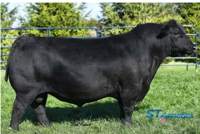
S Powerpoint WS 5503

Powerpoint is the go-to sire for growth, eye-appeal and muscle expression. His sons are big middled, expansive designed bulls. Powerpoint is proven cow maker with predictable calving ease and produces tremendous replacement heifers.