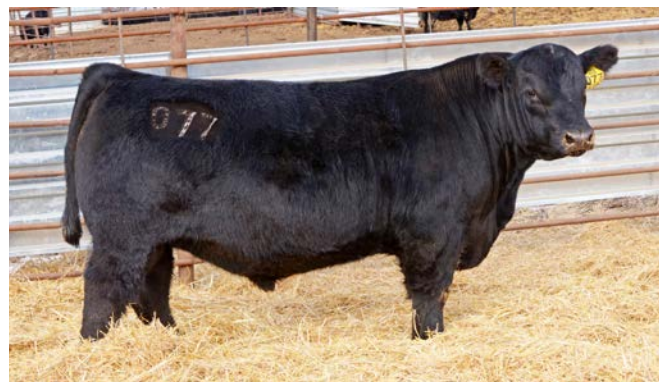
Fast Treasure 077 sold to Kerry Slaughter, Tappen, in our 2021 sale. He is a full flush brother to Lot 45.

You will instantly like this bull for his length of body, good muscle expression as well as wide topline and rump. A smaller framed bull, but very well put together. Yet another good one that goes back to the 734 and 24 cows. This bull should be the ideal type and kind you are looking for if you like moderation and great maternal abilities! Dam's ratio: 4/101