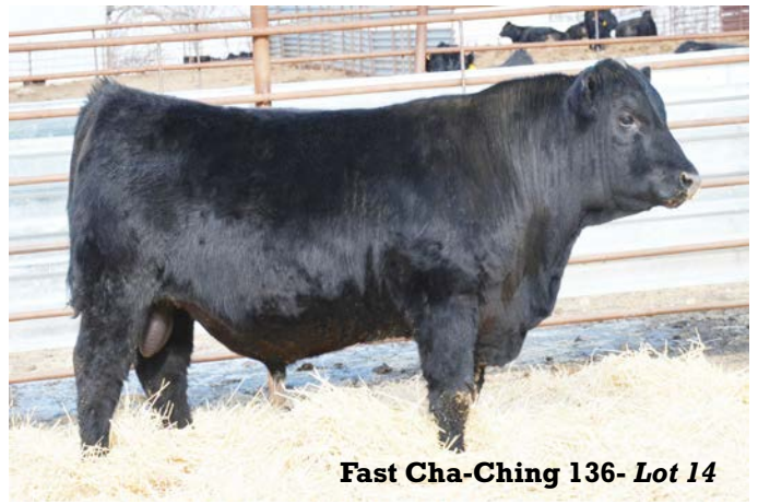
Fast Cha-Ching 136- Lot 14

If you want a scale crusher, you're going to want length and this bull has it in spades... probably the longest bodied bull in our entire sale offering! His pedigree combines three of the most superb performance cow families on this ranch; Eloises Ericas, Ericas and the Primrose Ladies. All have produced Pathfinder cows. In addition to all that performance, this bull offers added carcass value. Dam's ratio: 2/115.