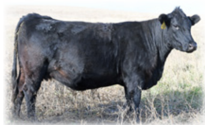
Fast Primrose 987 367, dam of Lot 23