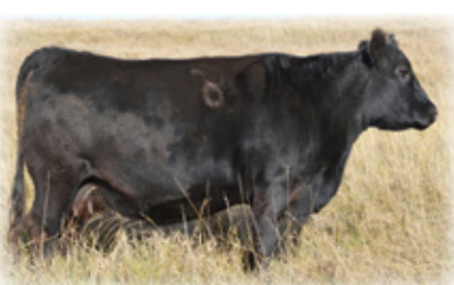
Strommen Primrose RLD, dam of Lot 17