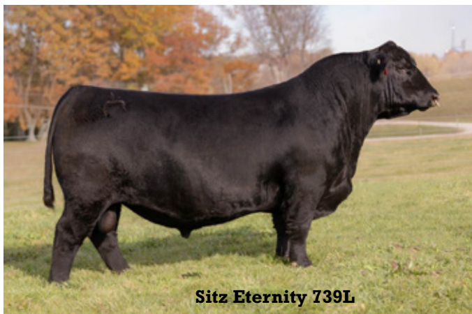
Sitz Eternity 739L