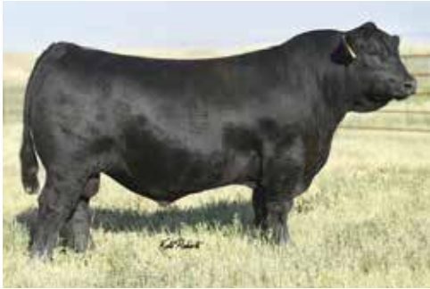
2 Sons Sell!