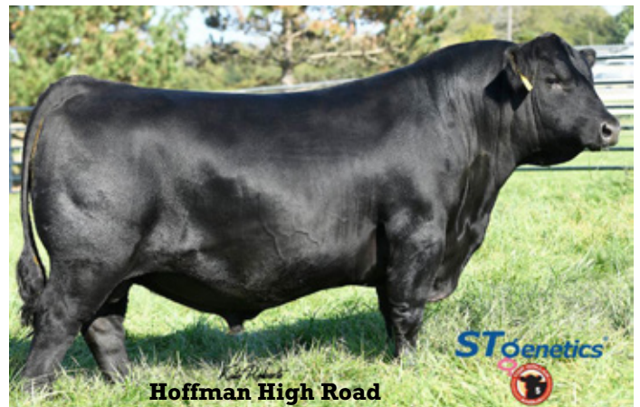
Hoffman High Road

High Road stems from the iconic donor in the Hinman and Hoffman programs, HA Rito Lady 3839, who is also the dam of Hoffman Thedford. High Road stands square on the ground with good feet, lots of rib shape and depth of body. He also adds muscle expression and mass.