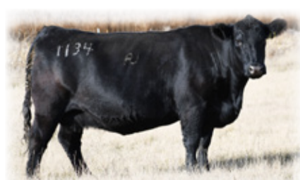
Fast Primrose RW 1134, dam of Lot 26