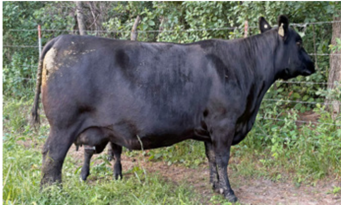
Miss Erica Ellston T261, the dam of Hoover No Doubt B94. She has a 364 day calving interval on 4 calves and a WW ratio of 4-101. Within the Hoover herd she ranks in the top 25 cows for Functional Longevity EPD (FL).

BW: 90 WW: 821 WW Ratio: 104 Dam's WR: 7-104 Marb: +.06 RE: +.84 Doc: +26 552 has a super wide top, is big hipped and long from hooks to pins. He structurally well made and is good footed. He ranks in the top 4% for claw, 2% for Angle and 1% for $M. Dam is one the most consistent top end progeny producers. She's had 6 bull calves and 5 have been picture bulls.