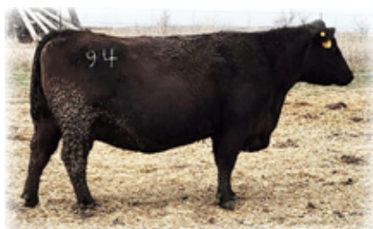
Fast Blackcap TR 94, dam of Lot 44