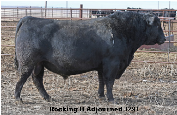
Rocking H Adjourned 1291

BW: 84 WW: 802 WW Ratio: 102 Dam's WR: 6-106 Marb: +.97 RE: +.54 Doc: +11 A smooth made bull with a super long spine, a straight topline and good depth of rib. He combines ideal calving ease traits with good carcass EPDs. His dam is the mother of Fast Cha-Ching 97. She is a picture perfect Angus cow for phenotype, sound feet and legs, and a quality shaped udder. She has produced 5 top quality sale bulls and a nice sale heifer. Top 10% CED, and 10% $M.