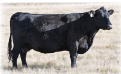
Fast Erica R 360, dam of Lot 21