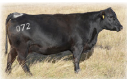
Fast Primrose Lady PP 072, dam of Lot 100