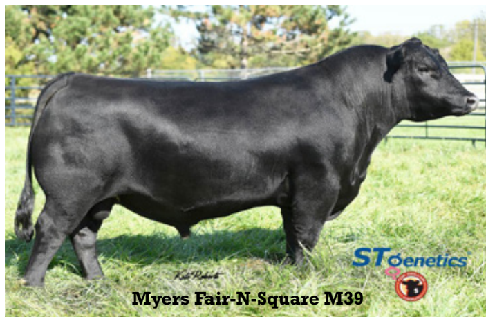
Myers Fair-N-Square M39