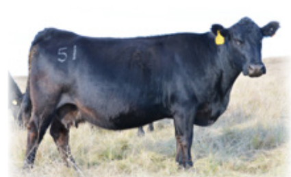
Fast Primrose Lady Pro 51, dam of Lot 43