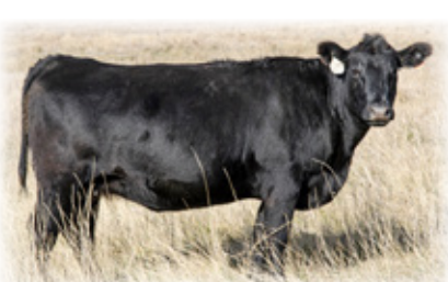
Fast Matilda CC 250, dam of Lot 38