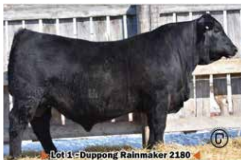
Lot 1 - Duppong Rainmaker 2180

Top 20% Fat, Top 35% $M. Beautiful Sensation dam with a beautiful udder.