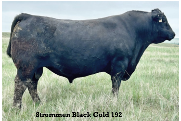
Strommen Black Gold 192

#MGR Treasure #VAR Discovery 2240 Fast Cha-Ching 97 SJH Impression of 6108 Fast Eloises Erica Com 730 #EF Commando 1366 #Fast Eloises Erica Conf 349 #Sitz Reload 411C #SAV Resource 1441 Strommen Erica RLD 980 #Sitz Forever Lady 612T Fast Erica Alt 272 Soo Line Alternative 9127W Fast Erica FL 734