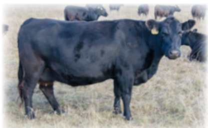
Fast Star Maiden RL 042, dam of Lot 30