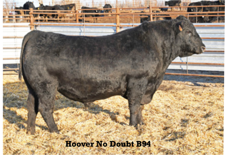
Hoover No Doubt B94

We purchased No Doubt B94 from Hoover Angus, Ellston, IA, in their 2024 sale. He is a very masculine bull that is easy fleshing, smooth made with lots of base width. He's a structurally correct, well-balanced, very attractive bull, that has a very easy to handle, gentle demeanor. Our heifers bred to him calved fairly easy, while his calves out of cows show a great deal of power and performance. He has sired an impressive group of bulls that are like peas in a pod for style, structural correctness, great dispositions, powerful performance and elite foot quality. B94 is a definite foot improver and is one of the best structured bulls in the beef cattle industry.