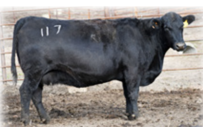
Fast Erica CC 117, dam of Lot 14