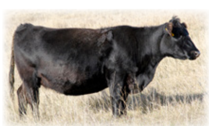
Fast Matilda TR 1114, dam of Lot 19