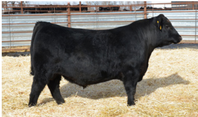
Fast Homesteader 123 sold in our 2022 sale and is a maternal half brother to Lot 40. Their dam, Fast Blackcap TR 923, is one of the most productive cows in our herd.

BW: 86 WW: 905 WW Ratio: 115 Dam's WR: 4-113 Marb: +.65 RE: +.86 Doc: +26 A soft, easy fleshing bull with eye appeal that is sure to catch your eye! He is wide over his top and deep through his side. He stands on a wide base and is good footed. His dam is a soggy, easy fleshing cow that never loses condition. She has produced 5 AI sired calves, 3 sale bulls and one replacement heifer. Top for 5% WW, 10% YW, and 15% $W.