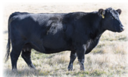
Fast Primrose Lady CO 1100, dam of Lot 7