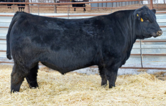
Fast Revitalize 191 is the sire of Lot 49 and sold in our 2022 production sale. He is also a maternal brother to lot 43.

BW: 90 WW: 813 WW Ratio: 103 Dam's WR: 5-107 Marb: +1.09 RE: +.64 Doc: +26 Phenotypically one of the best bulls in the sale! Structurally correct with a ton of eye appeal, he is deep through his rib and flank, has big testicles and stands on a good set of feet and legs. His dam, a Pathfinder cow, has produced 5 AI sired calves; 2 top quality sale bulls and 3 replacement heifers we have retained in our herd. Top 4% SC, 10% Claw, 25% Angle, 20% Doc, 25% Marb, 10% $M.