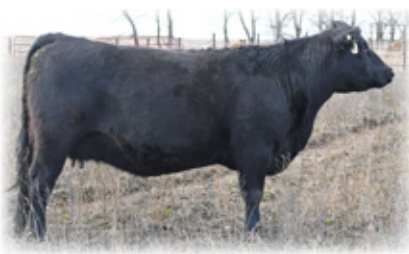
Fast Matilda JC 39, dam of Lot 2