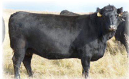
Fast Blackcap TR 138, dam of Lot 45