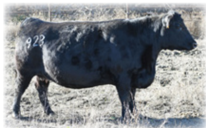
Fast Blackcap TR 923, dam of Lot 40