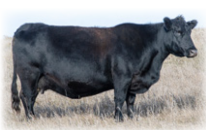
Fast Blackcap SP 8128, dam of Lot 42