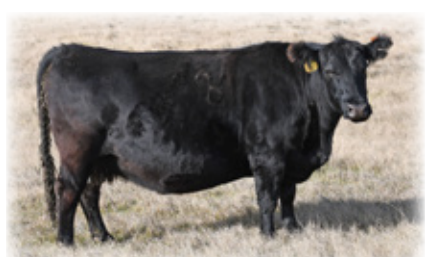
Strommen Prim Lady 043 724, dam of Lot 98