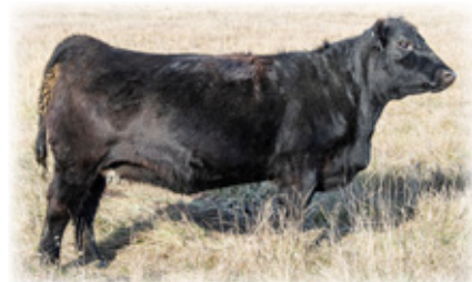
Strommen Erica AP 3106, dam of Lot 3